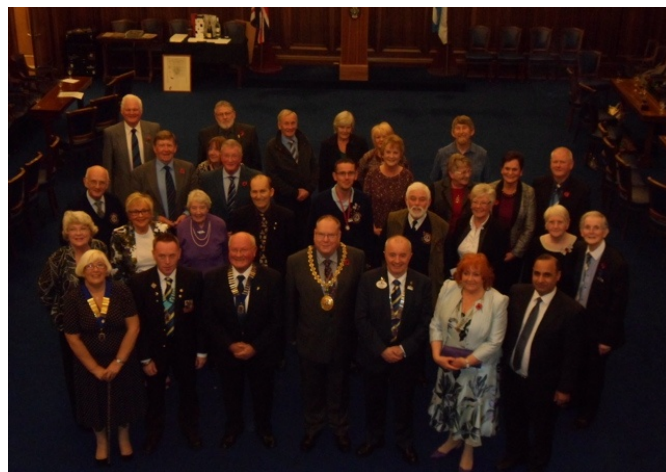
Lions, dignitaries, partners, friends and past Lions in Dundee City Chambers